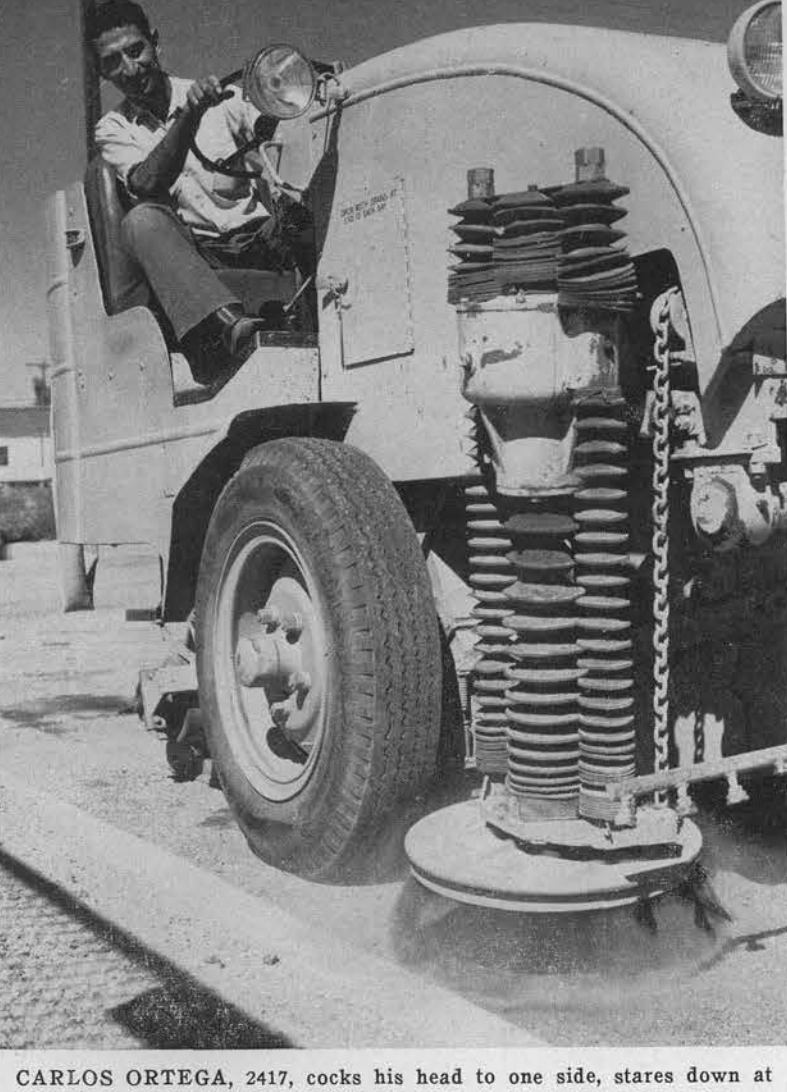
whirling fibre brooms of his Gutter Snipe street cleaner machine.

He received B. S. and M. S. degrees in mechanical engineering from the University of New Mexico, and also studied at Alabama Polytechnic Institute, City College of New York and Case Institute in Cleveland.